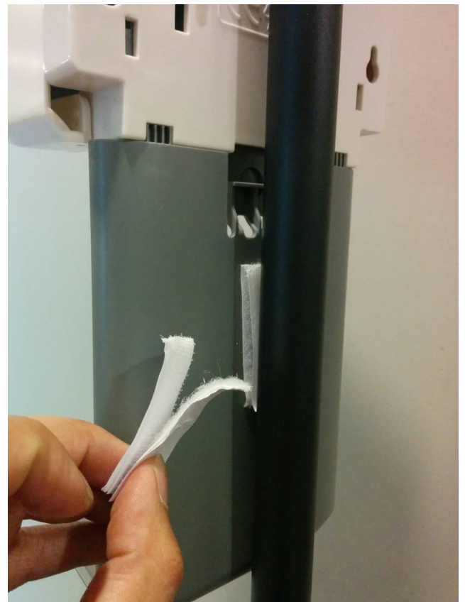
12) Using provided velcro strips, attach one side to drip tray and other side to the shaft. This is to prevent drip tray from detaching.