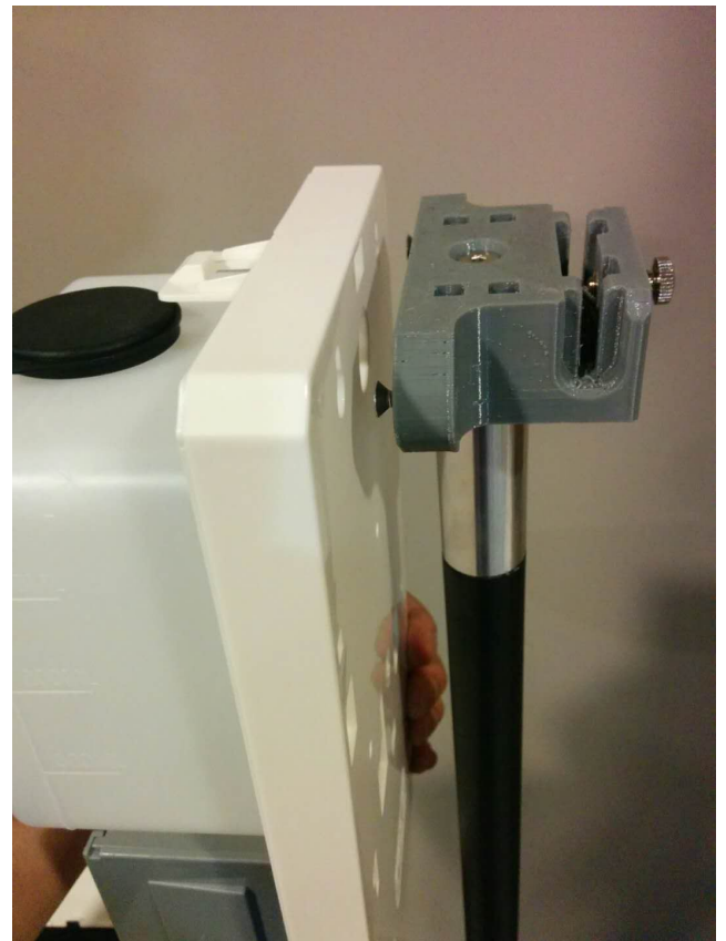
6) Mount dispenser on T-bracket by lining up screws on T-bracket with holes on back of dispenser. Screws may need to be loosened slightly to allow dispenser to fit.