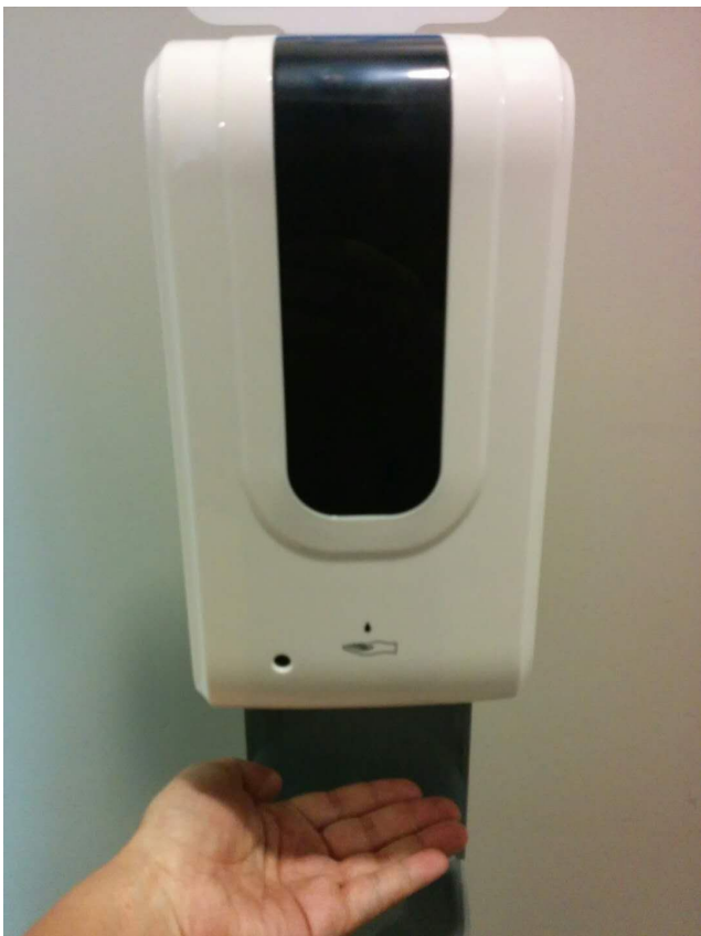
15) With dispenser on, place hand under dispenser for sensor to activate dispenser.