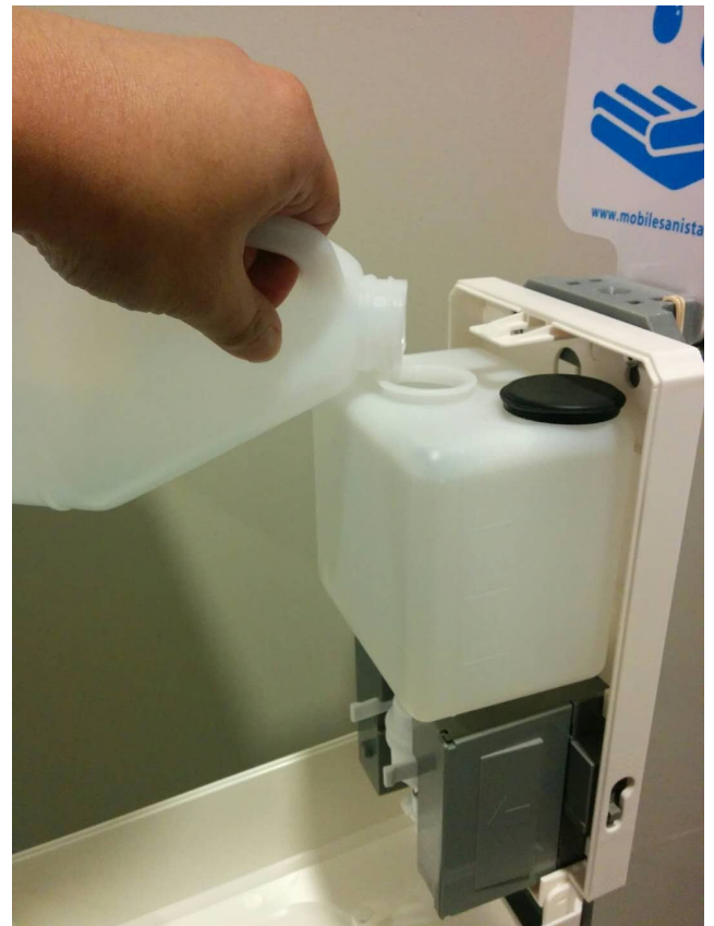
10) Remove black cap to fill container with sanitizer. Replace cap once done. Close dispenser.