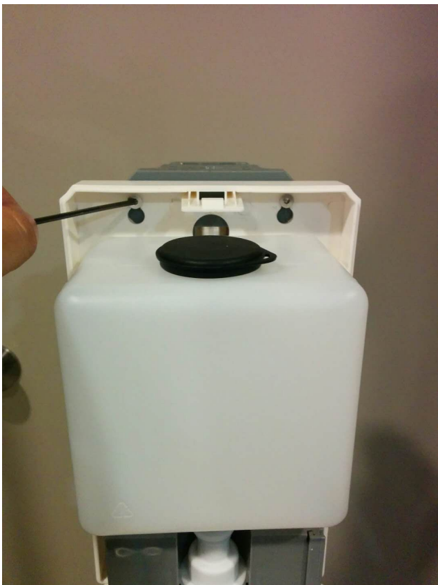
7) Using 2.5mm hex wrench (not included), tighten the screws so that dispenser is firmly attached to T-bracket.