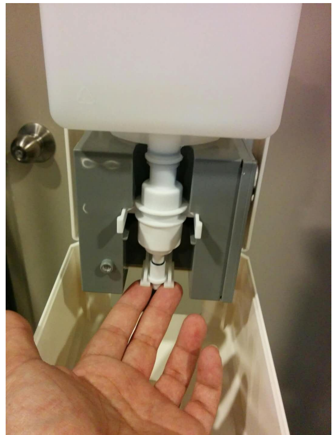
8) Placing two fingers under plastic tab at bottom of dispenser, press upwards and release several times to ensure smooth movement.