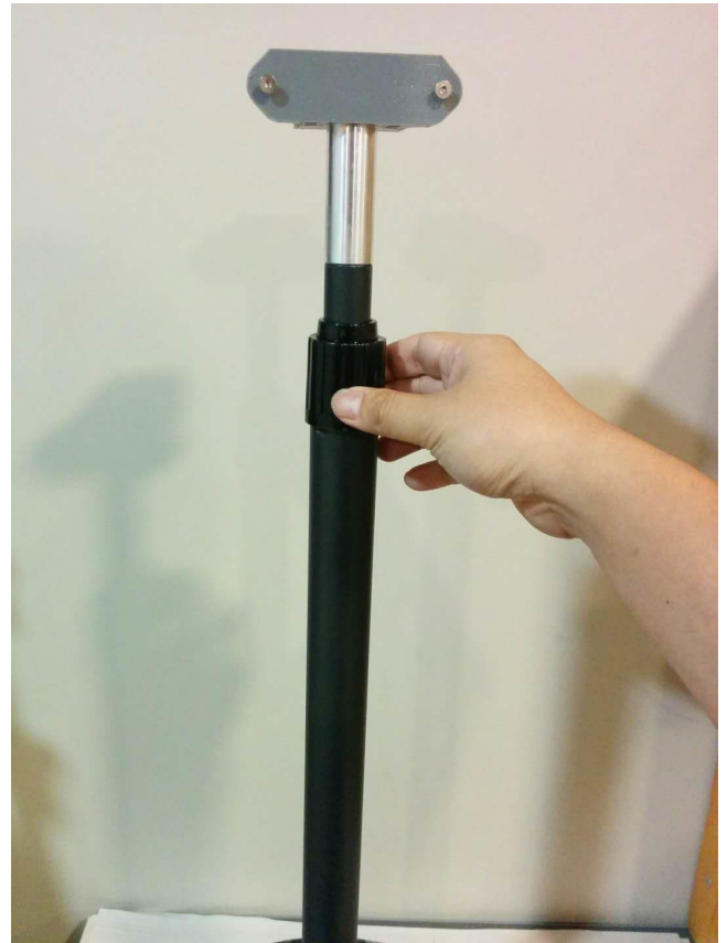
4) Turn plastic fastener counter-clockwise to loosen extension. Extend top part of shaft. Turn fastener clockwise to tighten.