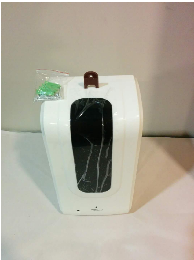
5) Insert brown, plastic key into holes on top of dispenser. Key can be found in small bag with wall-mounting screws(not used). Press key down to open dispenser.