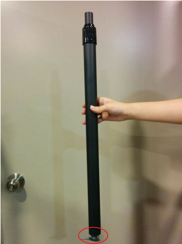
1) Unscrew L-bolt and washer from shaft