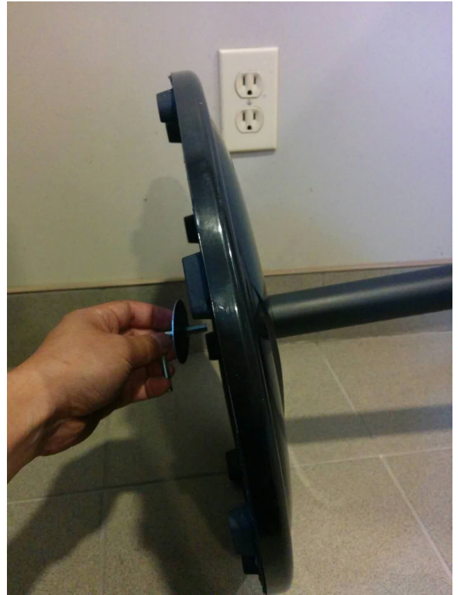
2) Insert shaft into base and attach using L-bolt and washer.