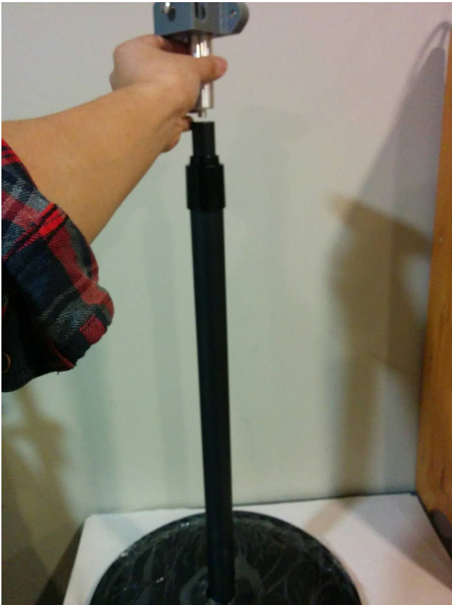
3) Attach T-bracket onto top of shaft. Hold aluminum part of bracket while tightening