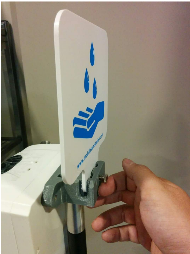
13) Attach display placard by inserting placard into groove on back of T-bracket. Line up hole in the placard with screw and tighten screw to hold placard in place.