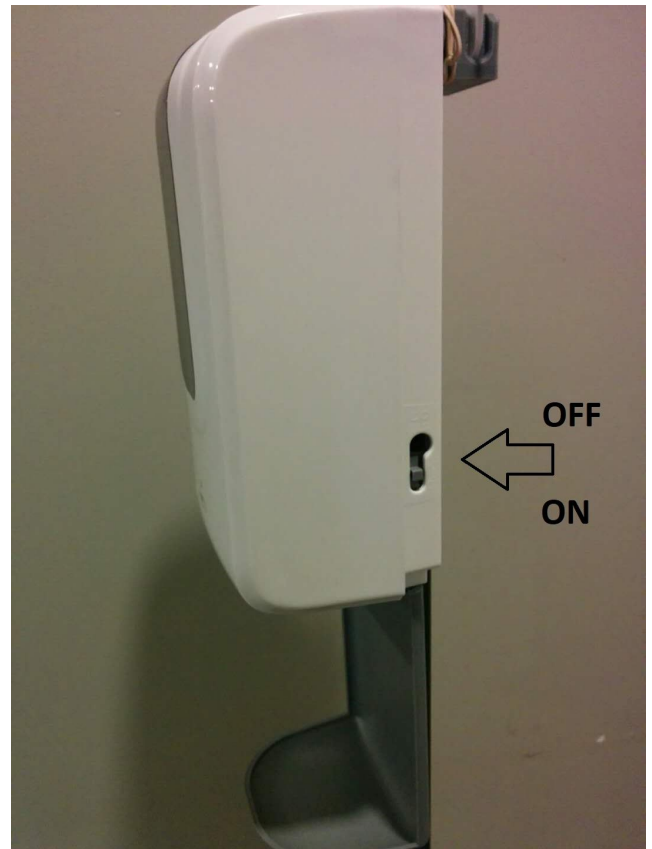
14) Turn dispenser ON by pushing switch downwards. Turn dispenser OFF by pushing switch upwards.