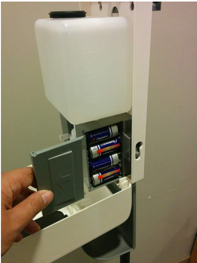
9) Slide off plastic cover on side of dispenser and insert batteries. Slide cover back on once batteries have been inserted.